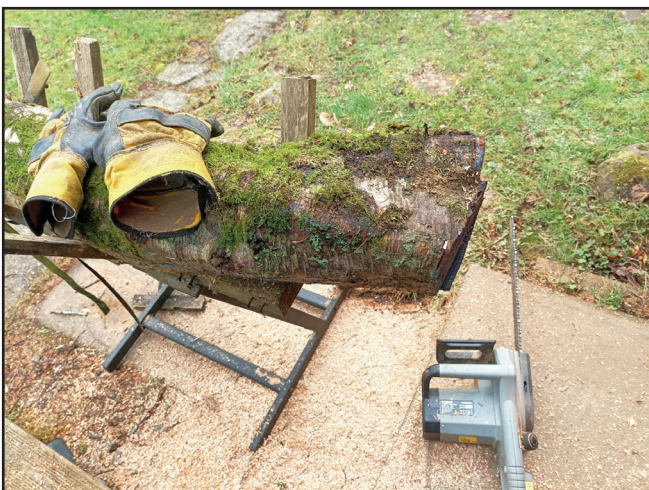
The end of the log prior to trimming and cutting with the chain saw