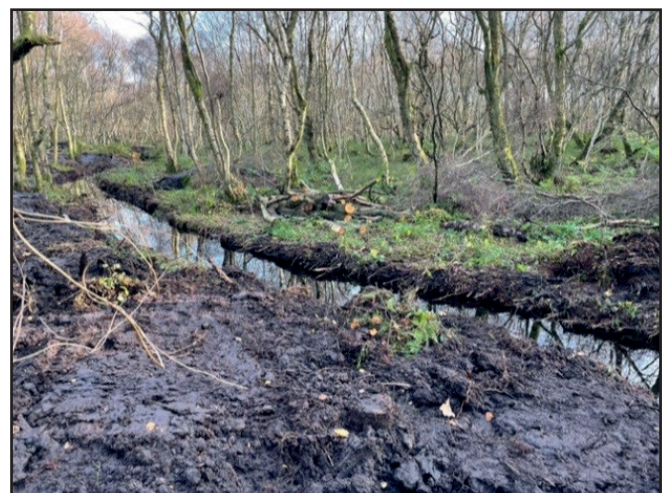
New channel put in to improve drainage in the north woods