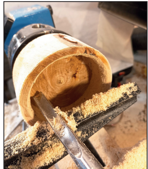
Cutting deeply into the blank