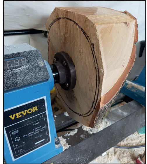
Bowl mounted on the lathe and ready for fashioning

These are just some of the photos that Ian sent us to show the making of a bowl. It's quite a complex process and you'll find more photos and descriptions on our website. Well worth a look.